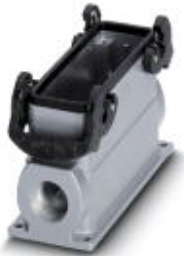
HEAVYCON box mounting base B24, with double locking latch, height 68 mm, with supports 2xM25

Please be informed that the data shown in this PDF Document is generated from our Online Catalog. Please find the complete data in the user's documentation. Our General Terms of Use for Downloads are valid ( http://phoenixcontact.com/download )