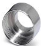
Step-up adapter, M25 to M32, including O-ring

Extension adapter - ENLAR-M-KV-M25/M32 - 1647679