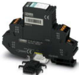
The figure shows the PT-IQ-1x2-24DC-PT version

Please be informed that the data shown in this PDF Document is generated from our Online Catalog. Please find the complete data in the user's documentation. Our General Terms of Use for Downloads are valid ( http://phoenixcontact.com/download )