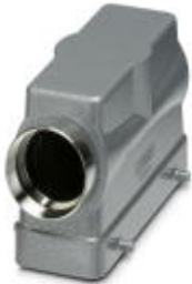
HEAVYCON sleeve housing B24, for double locking latch, height 76 mm, with support 1x M25, lateral conductor exit

Please be informed that the data shown in this PDF Document is generated from our Online Catalog. Please find the complete data in the user's documentation. Our General Terms of Use for Downloads are valid ( http://download.phoenixcontact.com )