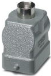
HEAVYCON B6 sleeve housing, for single locking latch, height: 56 mm, with 1 x Pg13.5 gland, straight cable outlet

Please be informed that the data shown in this PDF Document is generated from our Online Catalog. Please find the complete data in the user's documentation. Our General Terms of Use for Downloads are valid ( http://download.phoenixcontact.com )