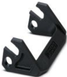
Replacement single locking latch for HEAVYCON EVO housing type B10, PA

Please be informed that the data shown in this PDF Document is generated from our Online Catalog. Please find the complete data in the user's documentation. Our General Terms of Use for Downloads are valid ( http://phoenixcontact.com/download )