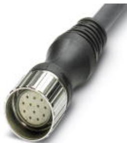
Socket M23, straight, 12-pos., with 20 m master cable

Please be informed that the data shown in this PDF Document is generated from our Online Catalog. Please find the complete data in the user's documentation. Our General Terms of Use for Downloads are valid ( http://phoenixcontact.com/download )