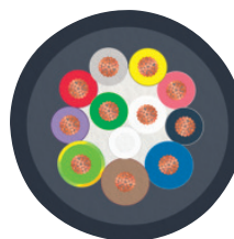
PUR/PVC black [PUR]