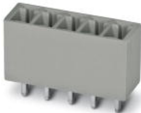
Header, Nominal current: 8 A, Rated voltage (III/2): 160 V, Number of positions: 11, Pitch: 3.81 mm, Color: pastel green, Contact surface: Tin, Mounting: Soldering

Please be informed that the data shown in this PDF Document is generated from our Online Catalog. Please find the complete data in the user's documentation. Our General Terms of Use for Downloads are valid ( http://phoenixcontact.com/download )