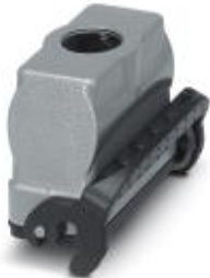
HEAVYCON B16 coupling housing, with single locking latch, height: 82 mm, with 1 x M25 gland, straight cable outlet

Please be informed that the data shown in this PDF Document is generated from our Online Catalog. Please find the complete data in the user's documentation. Our General Terms of Use for Downloads are valid ( http://download.phoenixcontact.com )