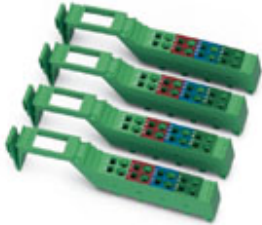
Connector set, for IB IL DI/DO 8, copper, with color print.

Please be informed that the data shown in this PDF Document is generated from our Online Catalog. Please find the complete data in the user's documentation. Our General Terms of Use for Downloads are valid ( http://phoenixcontact.com/download )