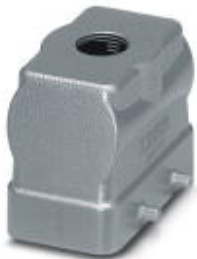
HEAVYCON B10 sleeve housing, for double locking latch, height: 72 mm, with 1 x M32 thread, straight cable outlet

Please be informed that the data shown in this PDF Document is generated from our Online Catalog. Please find the complete data in the user's documentation. Our General Terms of Use for Downloads are valid ( http://download.phoenixcontact.com )