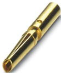
Crimp contact, turned, Contact diameter: 0.8 mm, Crimp range: 0.34 mm 2 ...0.5 mm 2

Please be informed that the data shown in this PDF Document is generated from our Online Catalog. Please find the complete data in the user's documentation. Our General Terms of Use for Downloads are valid ( http://phoenixcontact.com/download )