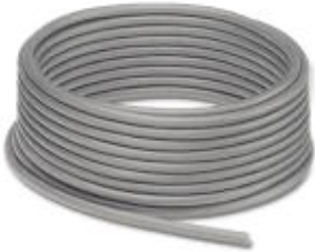
Sensor/Actuator cable, 4-position, PUR halogen-free, Gray RAL 7001, Free cable end, on Free cable end, Cable length: 100 m

Please be informed that the data shown in this PDF Document is generated from our Online Catalog. Please find the complete data in the user's documentation. Our General Terms of Use for Downloads are valid ( http://download.phoenixcontact.com )