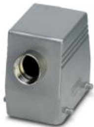
HEAVYCON sleeve housing D50, for double locking latch, height 76 mm, with support 1xM25, lateral conductor exit

Please be informed that the data shown in this PDF Document is generated from our Online Catalog. Please find the complete data in the user's documentation. Our General Terms of Use for Downloads are valid ( http://phoenixcontact.com/download )